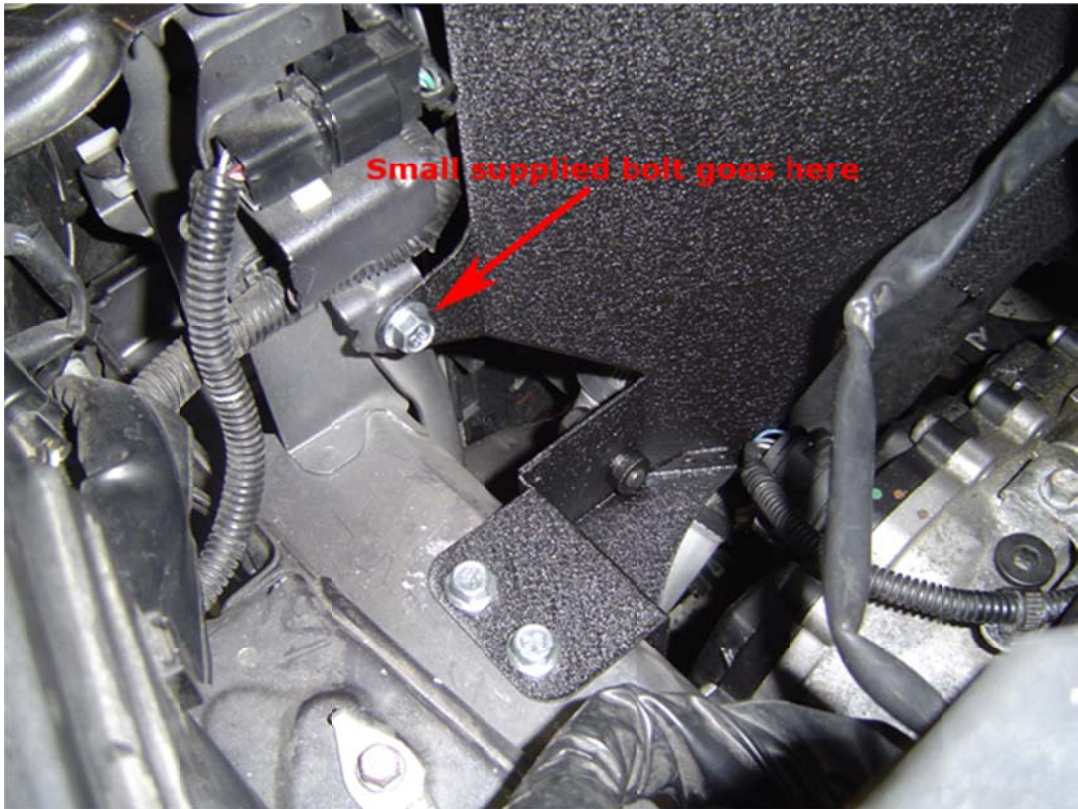
4. Once fan shield is tightened into place install the air filter onto the intake. The fan shield is fairly thin and can easily be slightly bent through shipping; it may need some light bending to fit perfectly in place.