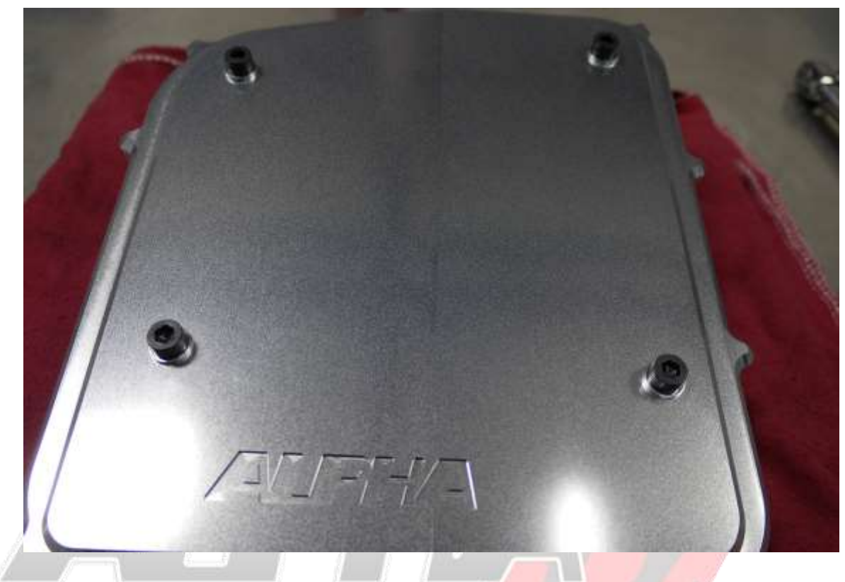
9. Clean sealing surface of transmission. Make sure no fluid/dirt remains.

8. Flip pick-up assembly over. Install included allen cap screws with washers into the threaded holes(4). Use high temp/strength thread locker. Torque to 90 in/lb