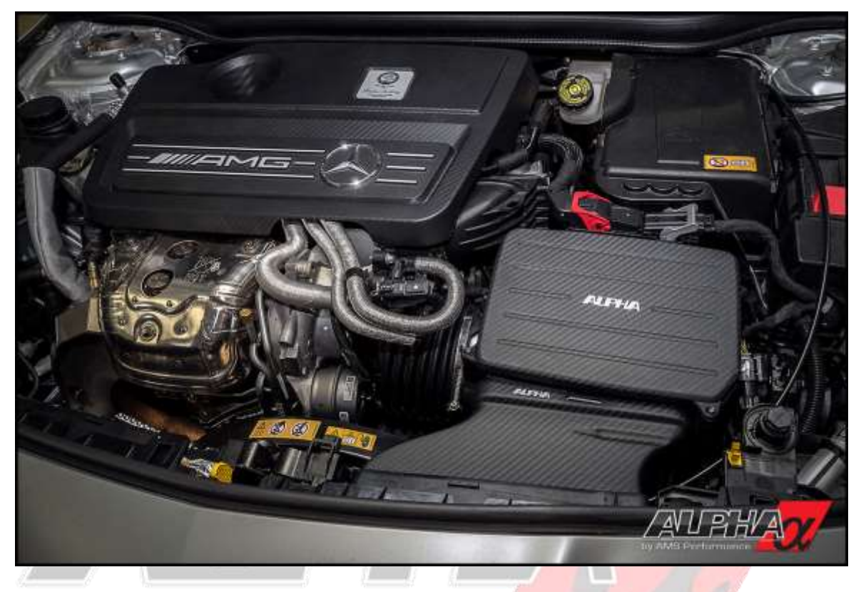
12) Reconnect the battery and reinstall the compartment cover. Double check all the connections are complete

11) Install the Carbon Air box lid using the factory screws that you had set aside earlier.